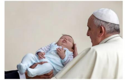
Pope Francis, pictured on Oct. 15, 2014.

2. Care – an open-ended process - In his message for the 54th World Day for Peace in 2021, Pope Francis in point no. 9 says, “There can be no peace without a culture of care. The culture of care thus calls for a common, supportive, and inclusive commitment to protecting and promoting the dignity and good of all, a willingness to show care and compassion, to work for reconciliation and healing, and to advance mutual respect and acceptance. As such, it represents a privileged path to peace. “In many parts of the world, there is a need for paths of peace to heal open wounds. There is also a need for peacemakers, men and women prepared to work boldly and creatively to initiate processes of healing and renewed encounter.”