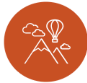
Ultimate Dialogue Adventure