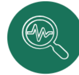
Pilots / Research