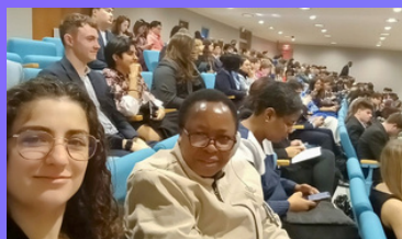
The intern and UN-NGO representative attending the Youth Forum

The office participated in the 2025 ECOSOC Youth Forum, the United Nation's largest youth gathering, held from April 15–17. Youth leaders convened to develop recommendations for Member States on the theme: "Youth at the Forefront: Leveraging Science and Social Inclusion for Sustainable Development."