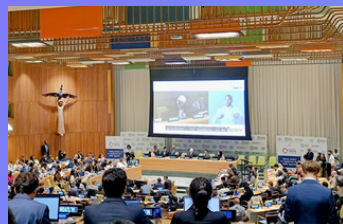
Opening ceremony of the Youth Forum