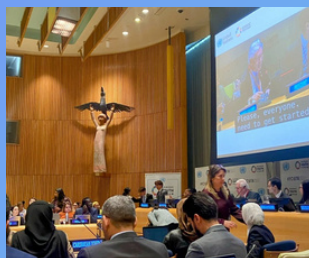
Plenary meeting on '#Youthlead from Local to Global: Meaningful Youth Participation in Policymaking and Decision-Making'