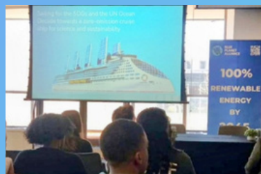
Side event on 'Sailing for SDGs and Zero Carbon Emission'