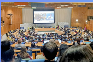
Plenary meeting on 'Empowering and engaging young people: the evolving role of science and technology'